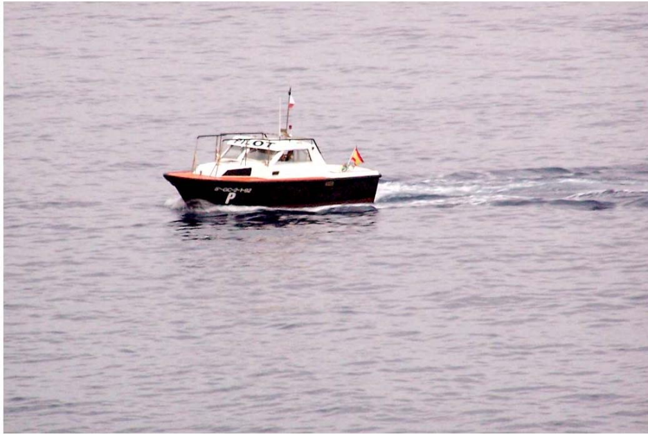
La Palma, Canary Islands