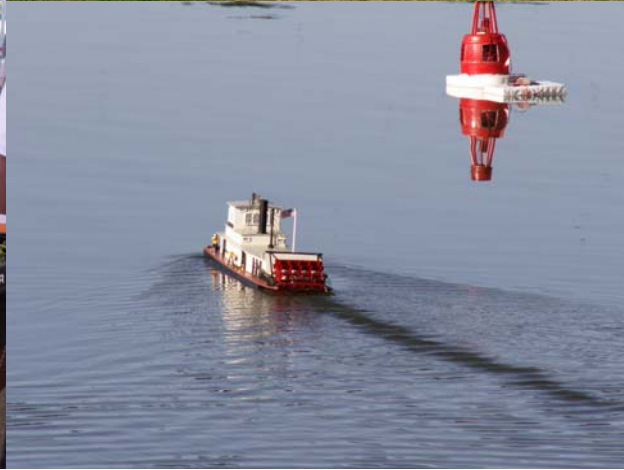
Memories of the Regatta at the Boat house in Forest Park, St Louis, Missouri

FROM THE EDITOR – Looking forward to seeing everyone at the Christmas Party, cost is $5.00 per Person. It will be greatly appreciated if you bring a dessert, appetizer, or snack for sharing. Coffee will be available; soda is available through the soda machine.