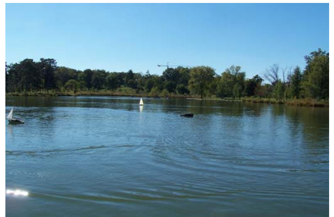
Running of the boats at the Boathouse Lake at Forest Park, St Louis, Missouri