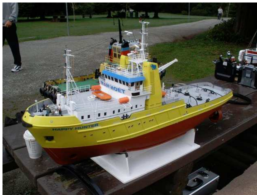
Beautiful Constructed Model from our Canadian Friends

***** *Tom Eckert found a boat carrier at the Boat House on the last day of the Regatta. Someone must have *forgotten to pick it up when they left. Please contact Tom at (314) 426-6244. *****