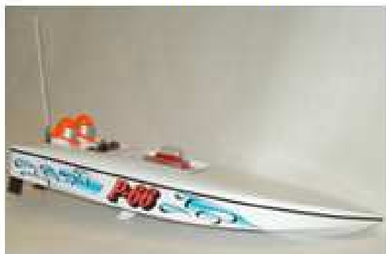
White shows through blue. (clear decal) white decal paper to get white background.