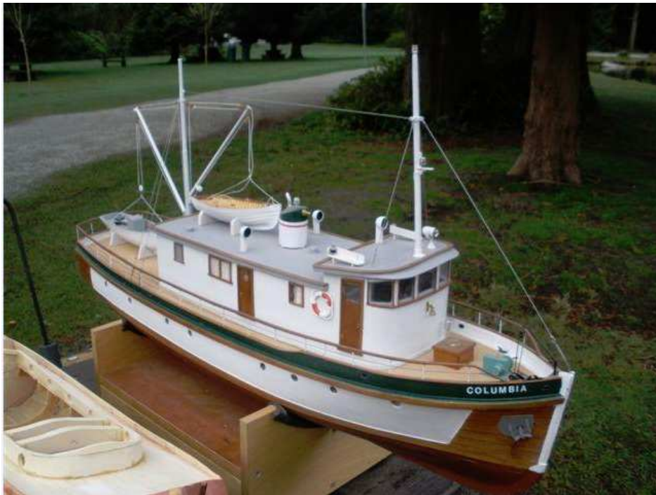
Another One of our Canadian Friend's Vessels